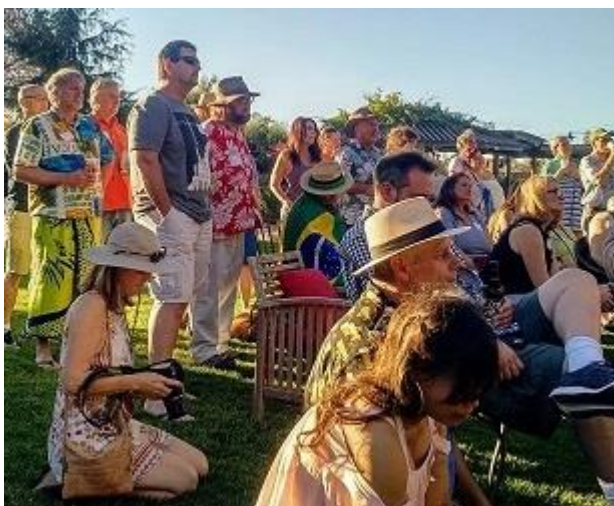
pinel reunion @ Sonoma, California, 7 October 2017.

To all pinelians with love JTEL IS COMING